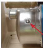
Figure 1.1 Priming Point